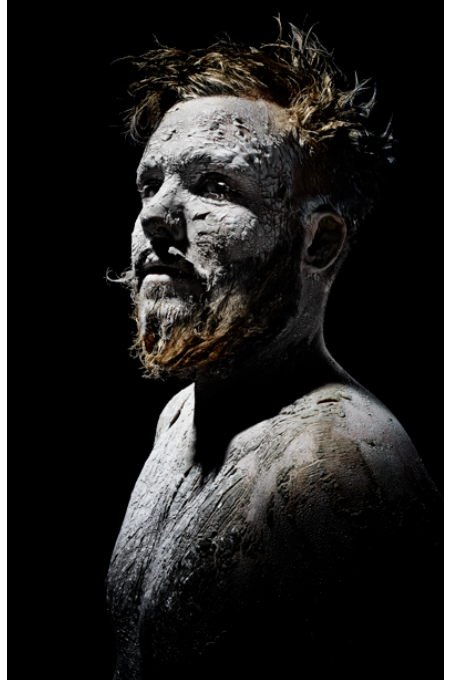
'I am a map of the places you have ruined...So now I come to ruin you.

I will tear down your house. I will burn the sheets that you long to roll in with that hot young flesh.